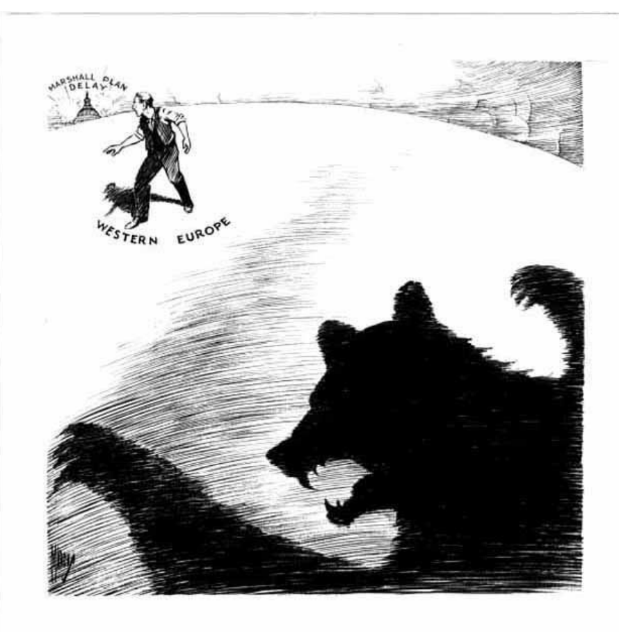
WHILE THE SHADOW LENGTHENS