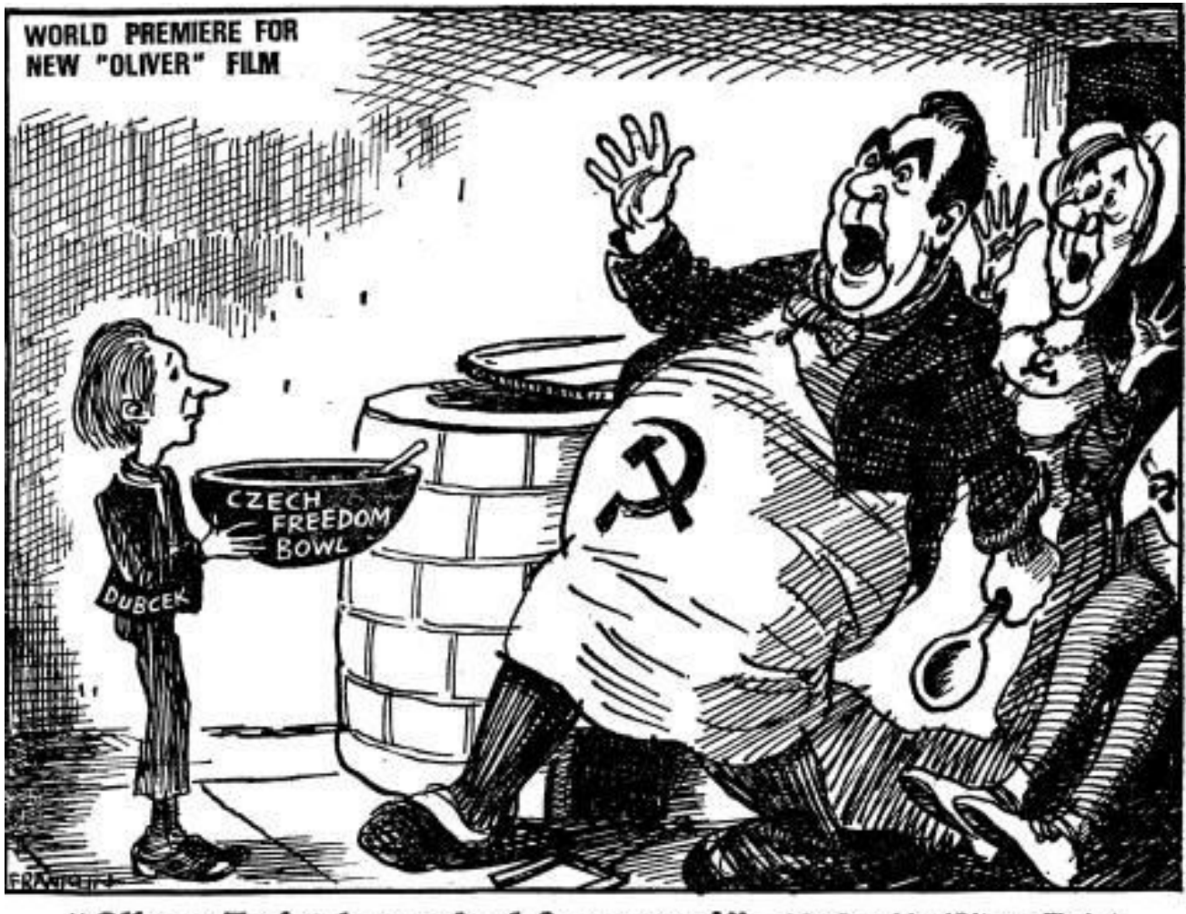
"Oliver Twist has asked for more!"-Mr Bumble (Oliver Twist)