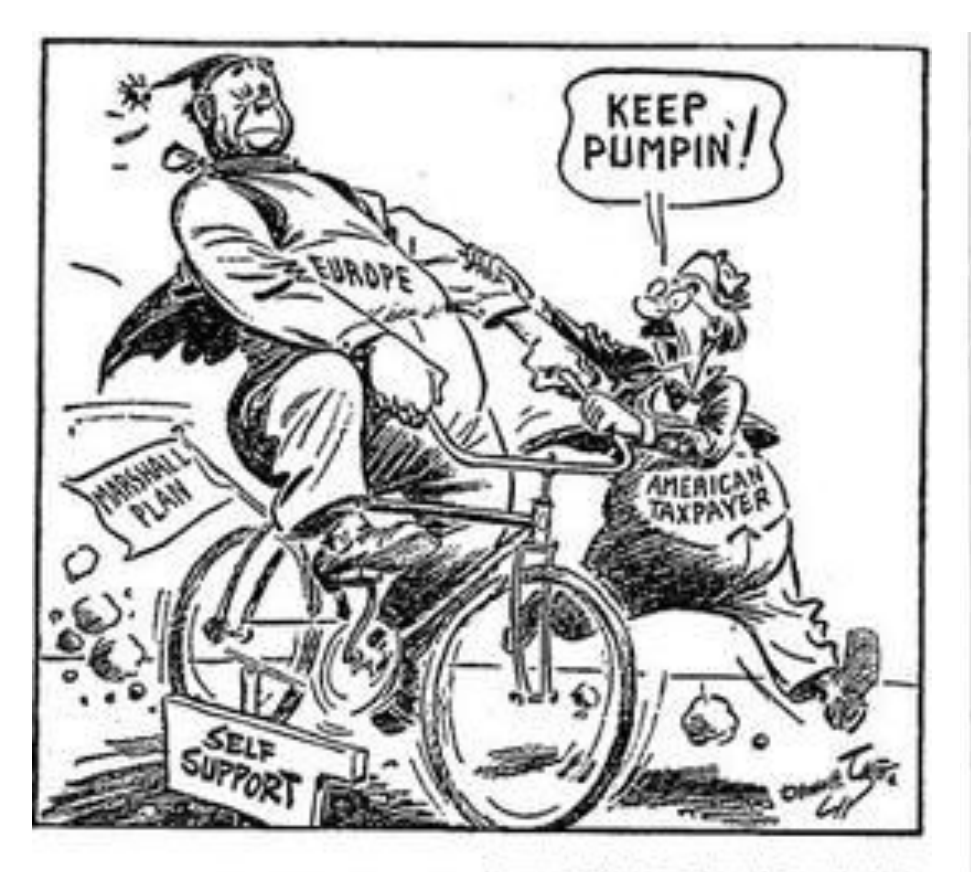
"He's finally getting the hang of it."