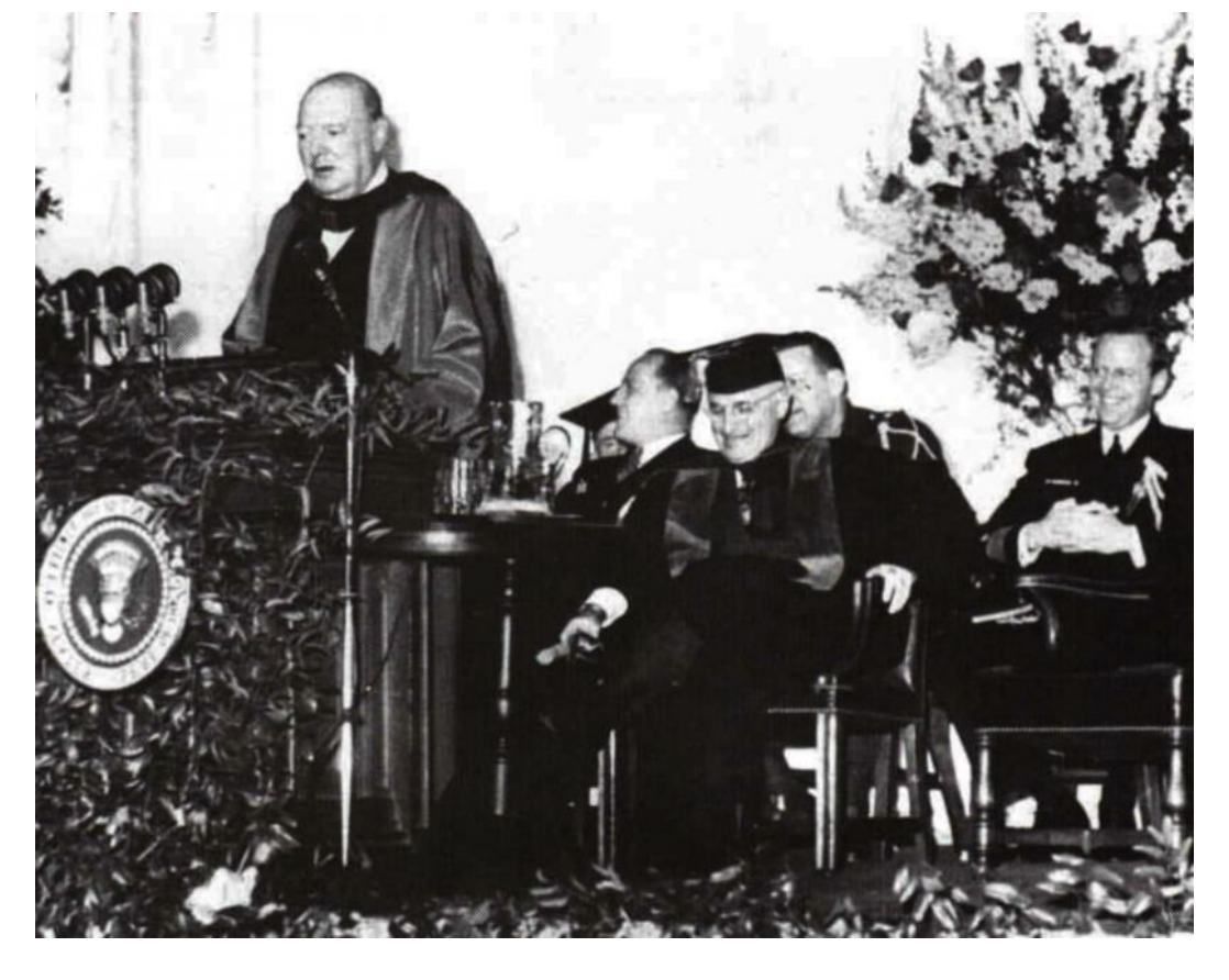
Churchill and Truman on stage at Westminster College, Fulton MO, during Churchill's "Iron Curtain" speech 1946.